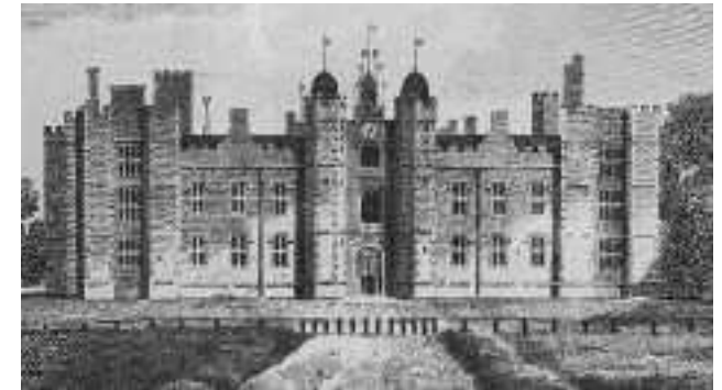
Cowdray, west view, before the fire

It was one of the most magnificent 16th century houses in Sussex, owned by noblemen who were related to the Tudor monarchs and held great offices of state during the reigns of Henry VII and Henry VIII. Cowdray was visited by Henry VIII (three times) and many of its