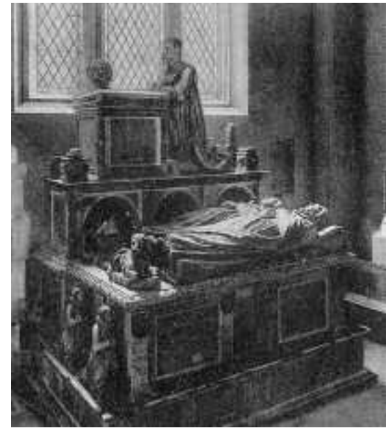
The elaborate tomb in Easebourne Church of the 1st Viscount Montague (died 1592) and his two wives. Originally much larger, it was reduced in size when transferred from Midhurst Church in 1851. Before then it was deliberately damaged by Parliamentary troops in the Civil War.

Georgian polite society was meeting at Cowdray, but the family had over-spent. The young 8th Viscount proposed marriage to the eldest daughter of the wealthy banker Mr Thomas Coutts, hoping to inherit his money.