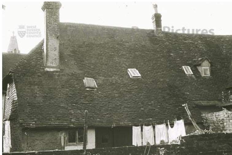
These photos above, courtesy of WSCC, show internal decorations and the rear view of Wool Lane